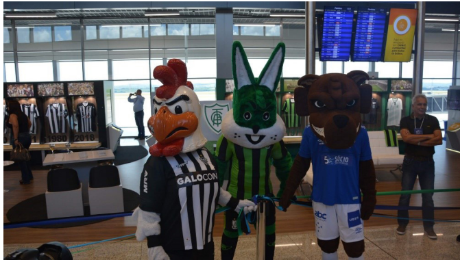
Figura 6 | Lounge dos Times domestic departure lounge

The Team's Lounge is part of a partnership between the concessionaire BH Airport and the local soccer clubs América Mineiro, Atlético Mineiro and Cruzeiro. It has exhibitions of historical pictures, team jerseys, and curiosities about the teams. The soccer teams represent a strong aspect of the local culture.