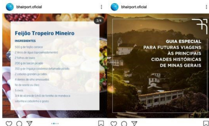
Figura 7 | Posts of BhAirport on social media Instagram – on the left, a local recipe, on the right, a tourist guide to the main historical towns of Minas Gerais.

The social media have been largely used by the BhAirport concessionaire, with the objective to reinforce the sense of place and establish the image of the airport. On Instagram, the posts address issues such as communication-related to improvements in the airport, tourists' activity tips in the state of Minas Gerais, and local cuisine recipes, as illustrated in Figure 7.