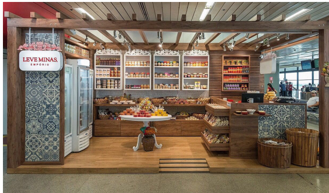
Figura 3 | Leve Minas Empório, a store at the domestic departure lounge with design, products and name related to the local culture.