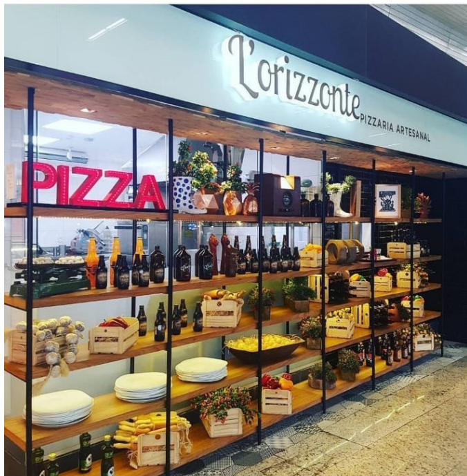
Figura 2 | L'orizzonte Pizzeria Artesanal, a handmade pizzeria located next to the check-in 1, with design, products and name related to the local culture.