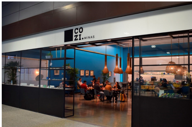
Figura 1 | Cozi Minas, a restaurant located in the international departure lounge, with design, products and name related to the local culture.