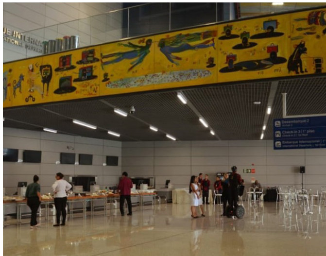
Figura 5 | Local artwork “Voar” by the local artist Fernando Pacheco.

The Figure 5 is one example of local art exposed at the Belo Horizonte International Airport.