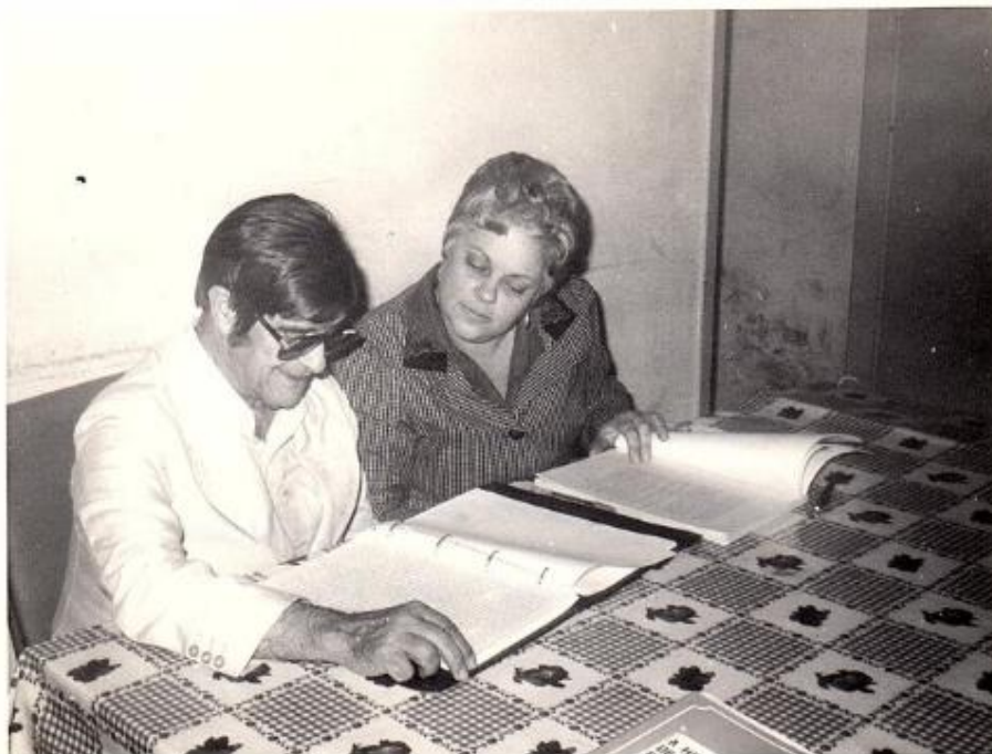
Image 1: Picture of Suely Caldas Schubert with Chico Xavier at the presentation of the manuscript of Testemunhos de Chico Xavier